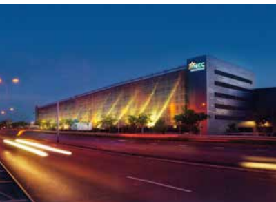
MECC - Best Dutch conference venue (Meeting Awards)

The Maastricht Convention Bureau is your partner when it comes to free, professional and independent information, advice and support regarding your conference in the Maastricht Region. With over twenty years of experience and in cooperation with all the relevant suppliers and knowledge institutes in the area, the Maastricht Convention Bureau can easily help you find the perfect venue and partners to make your conference a success and give it the attention it deserves.